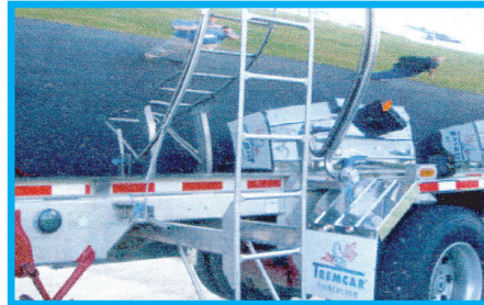
The DTZIPNT plastic strap seal in use sealing access points on tanker truck, one of many uses...